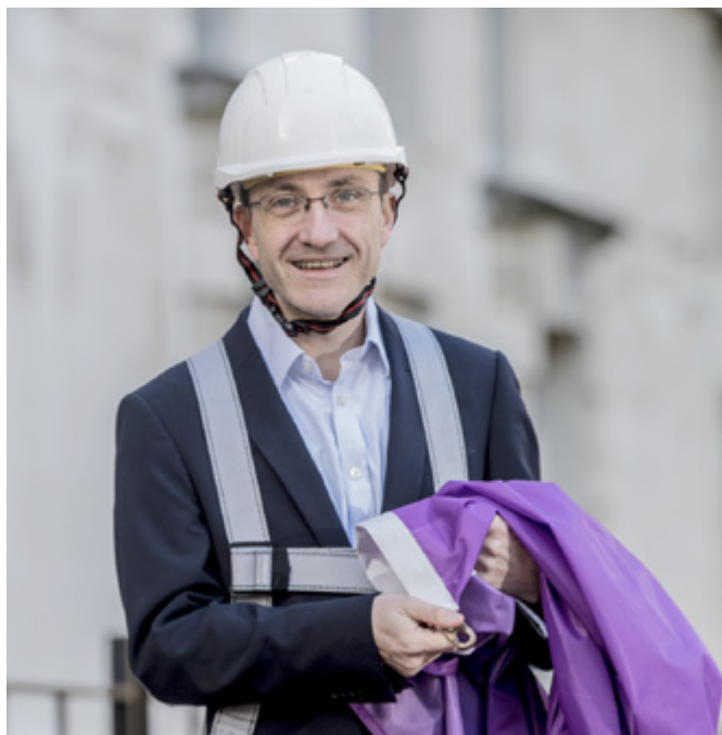
MOD Civilian Disability Champion promoting International Day of Persons with Disabilities.

Key TLB and ALB Levels of Ambition, actions and milestones will be included within the Defence People Plan; Defence Plan and individual Command and Corporate Plans. They will also be collated into a single high-level D&I plan, together with any pan-Defence initiatives being managed centrally, Progress against this will be monitored collectively by a D&I Board (see below).